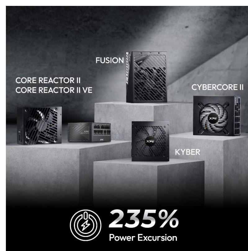
235% POWER EXCURSION