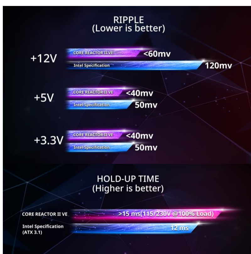
LOW RIPPLE NOISE DESIGN & >15MS HOLD UP TIME