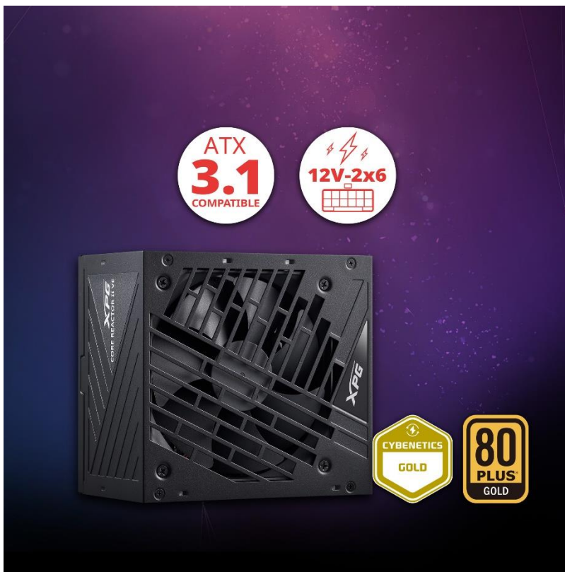
ATX 3.1 COMPATIBLE

XPG CORE REACTOR II VE empowers your system with efficient power delivery. It's compatible with Intel's latest ATX 3.1 design guidelines and has a dedicated 12V-2x6 connector for the latest graphics cards. This unit boasts a DC-DC circuit design for enhanced performance, stability, and consistency, with exceptional ripple control and hold-up time surpassing Intel's specifications. It has 8 industrial protections fortifying its durability, safeguarding both the unit and your system.