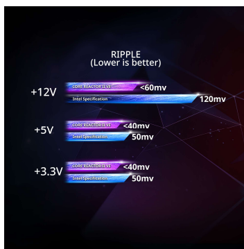
LOW RIPPLE NOISE DESIGN