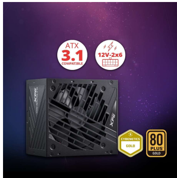
ATX 3.1 COMPATIBLE

XPG CORE REACTOR II VE empowers your system with efficient power delivery. It's compatible with Intel's latest ATX 3.1 design guidelines and has a dedicated 12V-2x6 connector for the latest graphics cards. This unit boasts a DC-DC circuit design for enhanced performance, stability, and consistency, with exceptional ripple control and hold-up time surpassing Intel's specifications. It has 8 industrial protections fortifying its durability, safeguarding both the unit and your system.