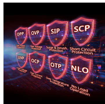
8 INDUSTRIAL PROTECTIONS