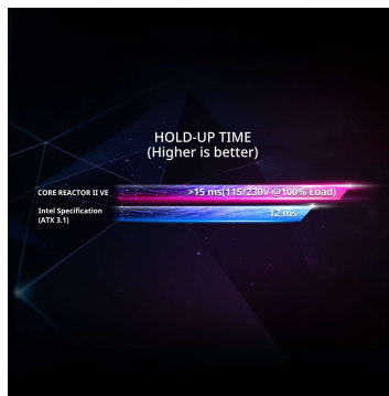
>15MS HOLD UP TIME