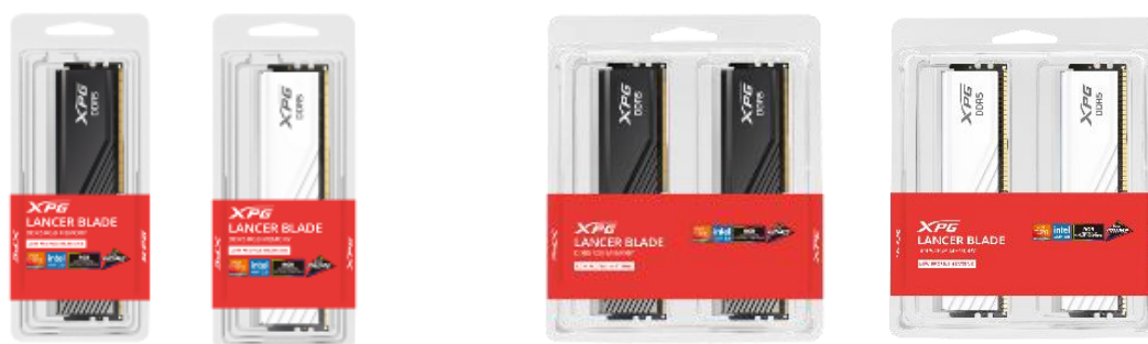
Single Tray Package